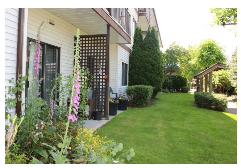
*Prices vary by floor and view